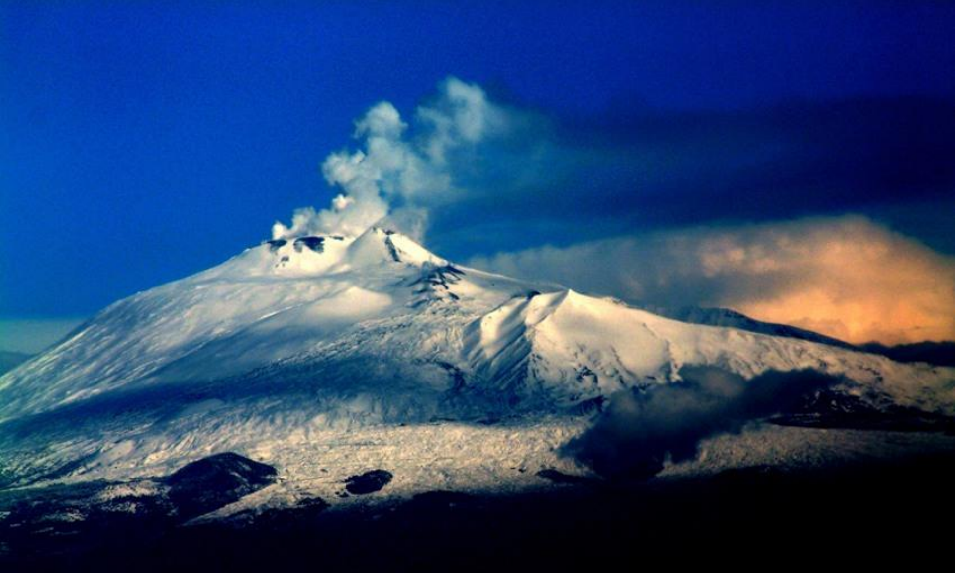
Etna (3.322 m) major active volcano in Europe and the highest mountain in Italy, south of Alps.