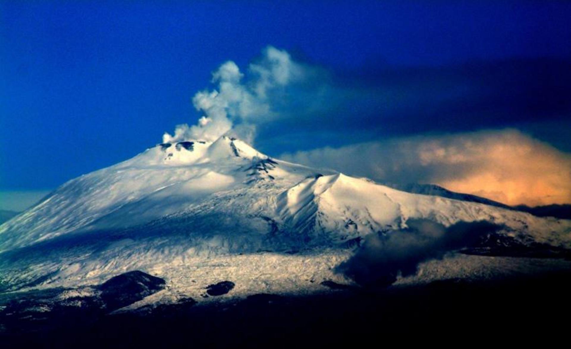
Etna (3.322 m) major active volcano in Europe and the highest mountain in Italy, south of Alps.